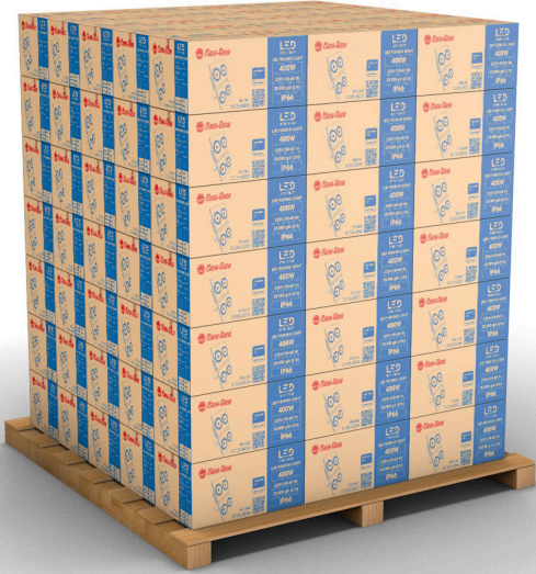
Customizable according to customer's request